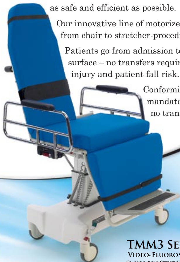
TMM3 SERIES VIDEO-FLUOROSCOPY/ SWALLOW STUDY CHAIR

Conforming to industry mandates of no lift, no transfer.