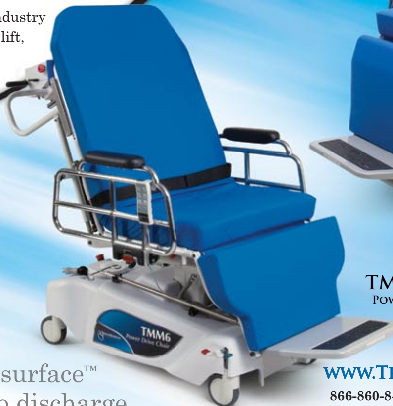
TMM6 SERIES POWER DRIVE CHAIR