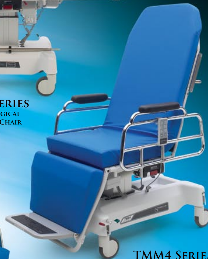
TMM4 SERIES MULTI-PURPOSE TREATMENT CHAIR